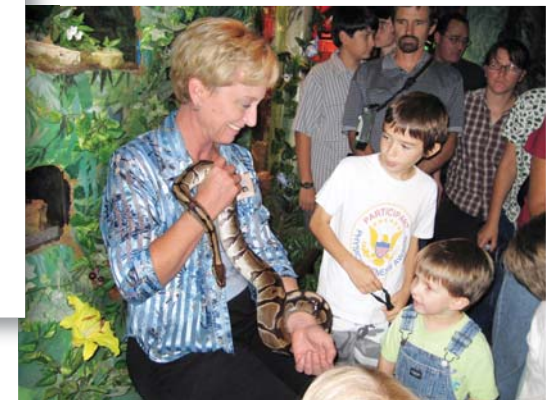
Does life have a purpose?