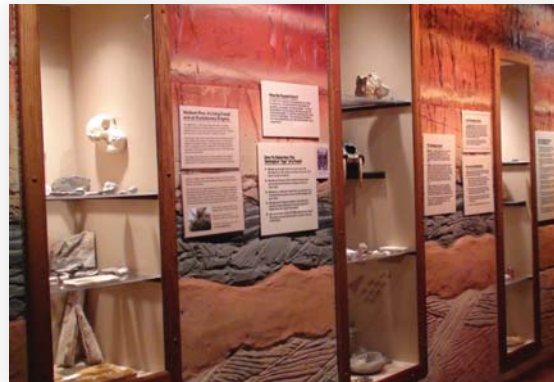
When did the dinosaurs live and how did they become extinct?