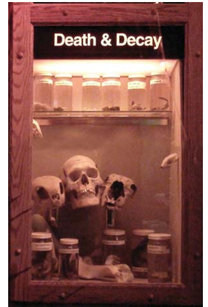
If God is good, why is there pain and suffering in the world?