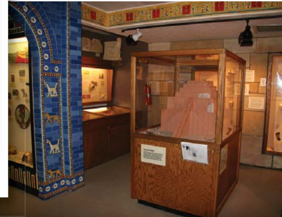
What about the origins of mankind, nations and languages?