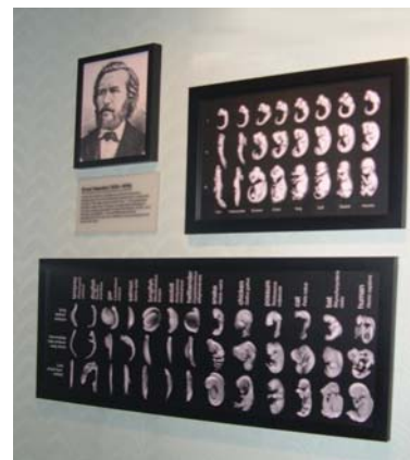
Is the Bible compatible with the Theory of Evolution?