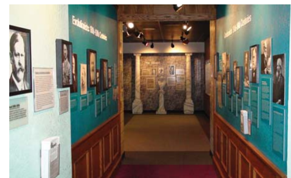
Does history have a purpose?