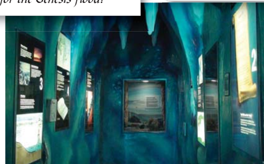
How many Ice Ages were there?