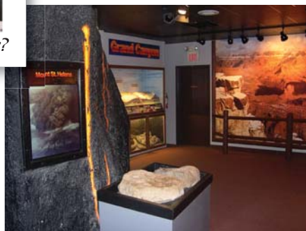
Is there evidence for the Genesis flood?