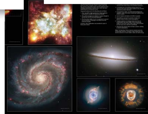
Is the Bible compatible with the "Big Bang" Theory?

The exhibits at this museum are based on true Biblical history, beginning with creation in Genesis 1. This journey will continue through the rebellion of humanity against the Creator, the worldwide flood of Noah's time, the dispersion at Babel, the history of Israel and the Gentile nations, the redemptive work of Jesus Christ, and the consummation of God's purposes for creation when Jesus returns.