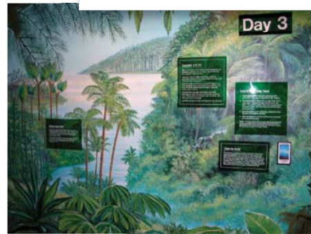
What was the first life?