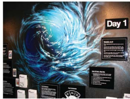
How did the earth and the universe originate?

At the Creation and Earth History Museum, you will experience a journey through time . . . In the museum you can find answers to life's perplexing questions: