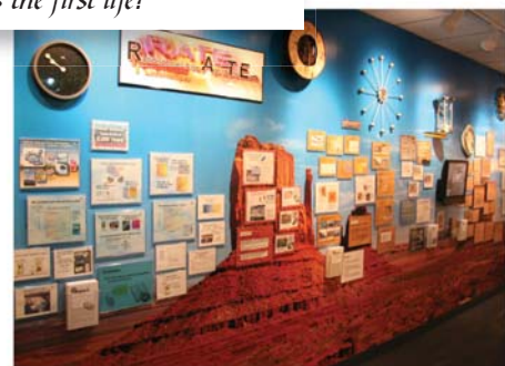
How accurate are radioisotopic dating methods?